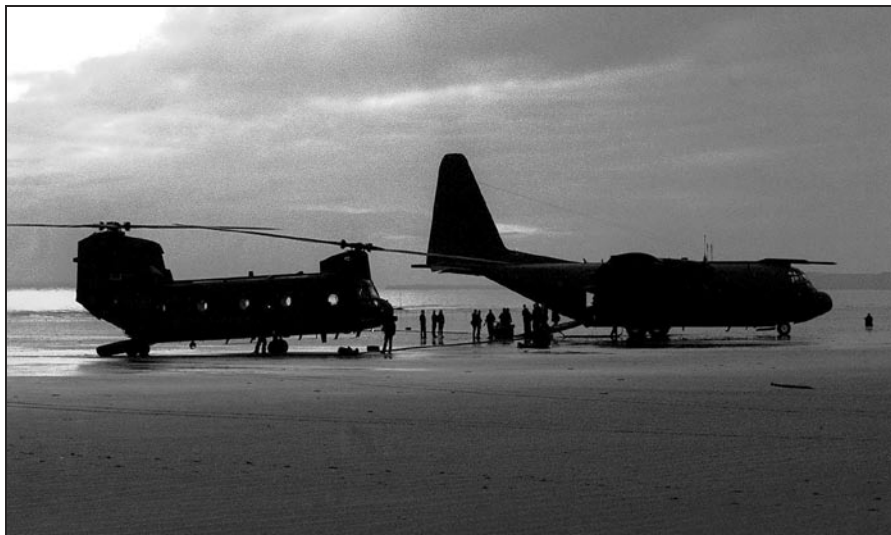
Figure 3. Special Operations C-130 and Chinook. C-130 transloads fuel and personnel to a Chinook at an austere landing zone. (Used by permission from U.K. MOD.)

The flying part of special operations aviation is the most difficult to achieve because of resources, manpower, and fiscal considerations. MC 437/1 requires that a national special operations task group possess the ability to infiltrate and exfiltrate using air [emphasis added], land, and sea means into and out of the opera-