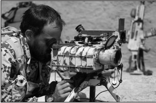
Figure 4. Battlefield Airmen in Action. Special operations terminal attack controller marking a target for a strike by conventional air power. (Used by permission.)

operators from most of the member nations and all the different armed services in the past 4 years indicates that they want and need published NATO standards, whether in AJPs or in NATO Standardization Agreements (STANAGs) to guide the member nations' leadership as they develop and equip air and aviation forces for special operations.