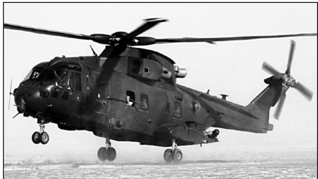
Figure 1. EH-101 Special Operations Version. The Agusta Westland EH-101 is being considered by a number of nations as their future special operations helicopters due to its large capacity (30 combat troops or 5 tons), long range

(750 nautical miles), aft ramp, advanced avionics, and aerial refueling capability.